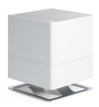
<u>Oskar</u> humidifier in white, current webshop price, CHF 139.-<u>Oskar little</u> humidifier in white, current webshop price CHF 99.-<u>Oskar bia</u> humidifier in black, current webshop price CHF 199.-

The Karl, Oskar and George humidifiers from Stadler Form are available on <u>https://www.stadlerform.com</u> from selected specialist retailers and their online shops.