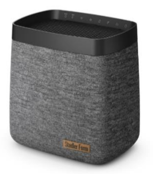
<u>Karl</u> humidifier from Stadler Form, current webshop price CHF 259.-<u>Karl big</u> humidifier from Stadler Form, current webshop price CHF 379.-